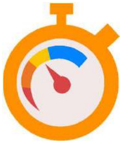
STRESS TESTING [routines]