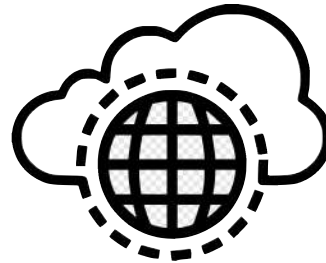
Move to CLOUD [accelerate]